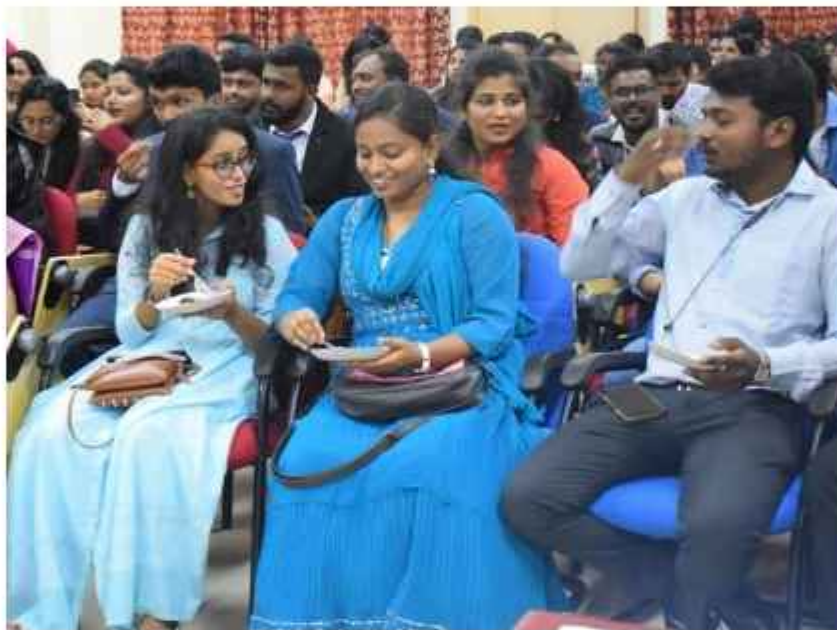
Outgoing students happy to be back once again