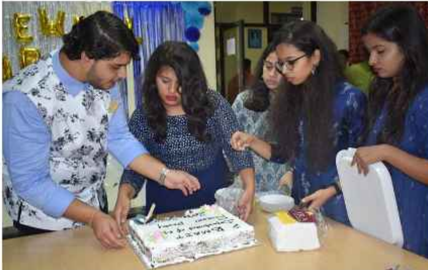
Students enjoying the moment