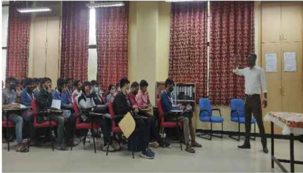
Resource person delivering the session