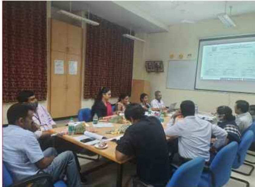
BoS meeting under progress