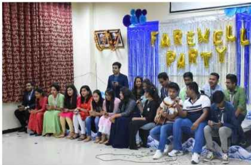
Performance by the juniors during farewell